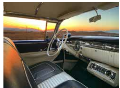
1955 Oldsmobile 98 hardtop on a California Sunset! What could be nicer?