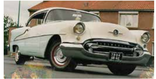
My French 1955 Oldsmobile Super 88 2 doors Hardtop

I'm from overseas, from a town called Lille in the northern part of France, all the way up, right by the Belgium border, where cars are small, somehow weird looking and boring. As long as I can remember, American cars have always fascinated me. I'm not sure what happened as a toddler, but the Detroit's Fairy put a good spell on me! The shiny chromes, the rumbling of the engines, the immensity of the beast, it was enough for me to embrace with a big smile the spell!