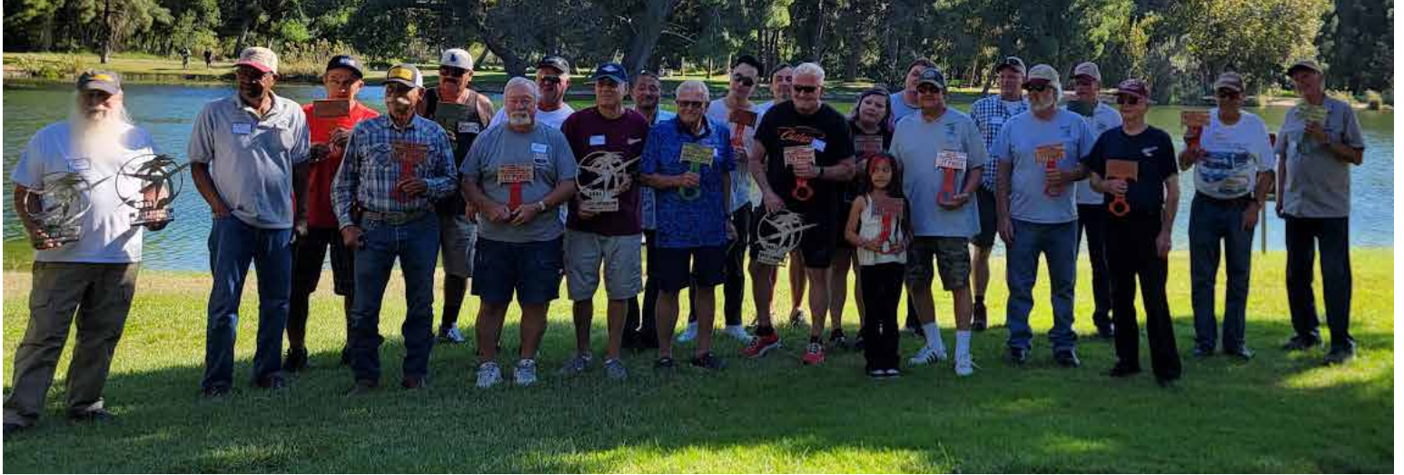
All our Memorial Show 2023 winners. Congrat's Congratulations