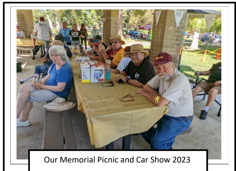
Our Memorial Picnic and Car Show 2023