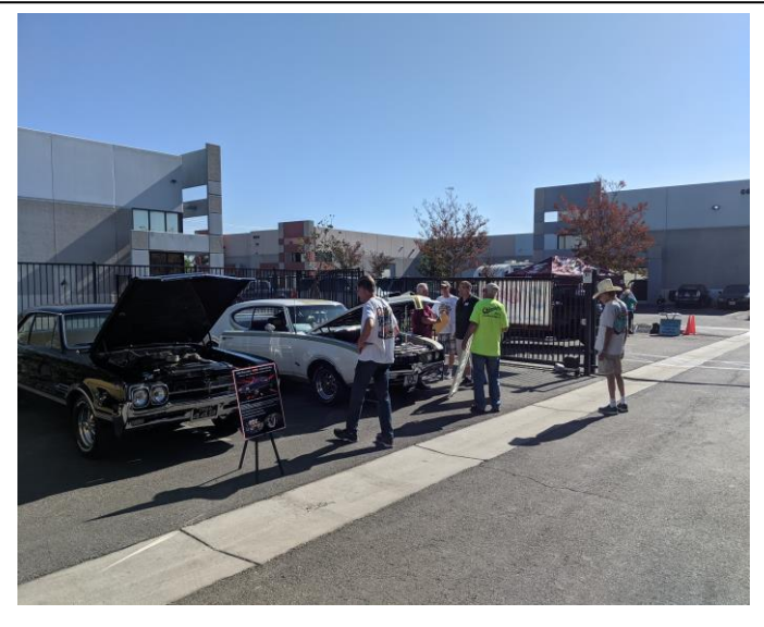
Thank you to everyone who sent me photos they took!